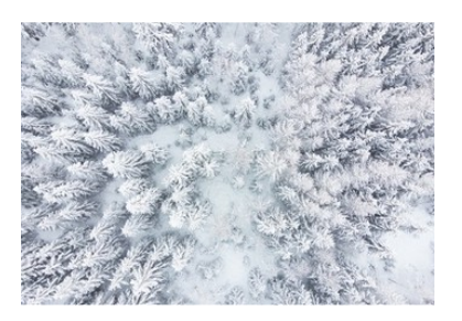
the tops of the trees." Find winter poems here.