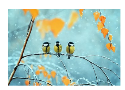
all the singing is in