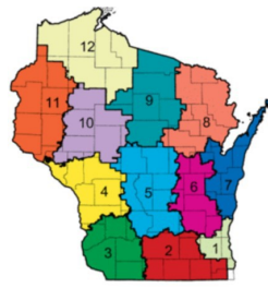
Map of Wisconsin with color coded CESA regions